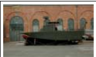
Mare Island is the oldest Naval Base on the West Coast dating back to 1850

For dinner we will transport ourselves to the Mare Island Historic Museum located just up the street—directions to walk or ride will be given after the program. Built in 1855 and a former pipe shop until 1984 it is filled with fascinating artifacts.